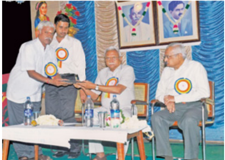
Our Chairman distributing prizes on the occasion of our 31 st Annual Sports Day function.