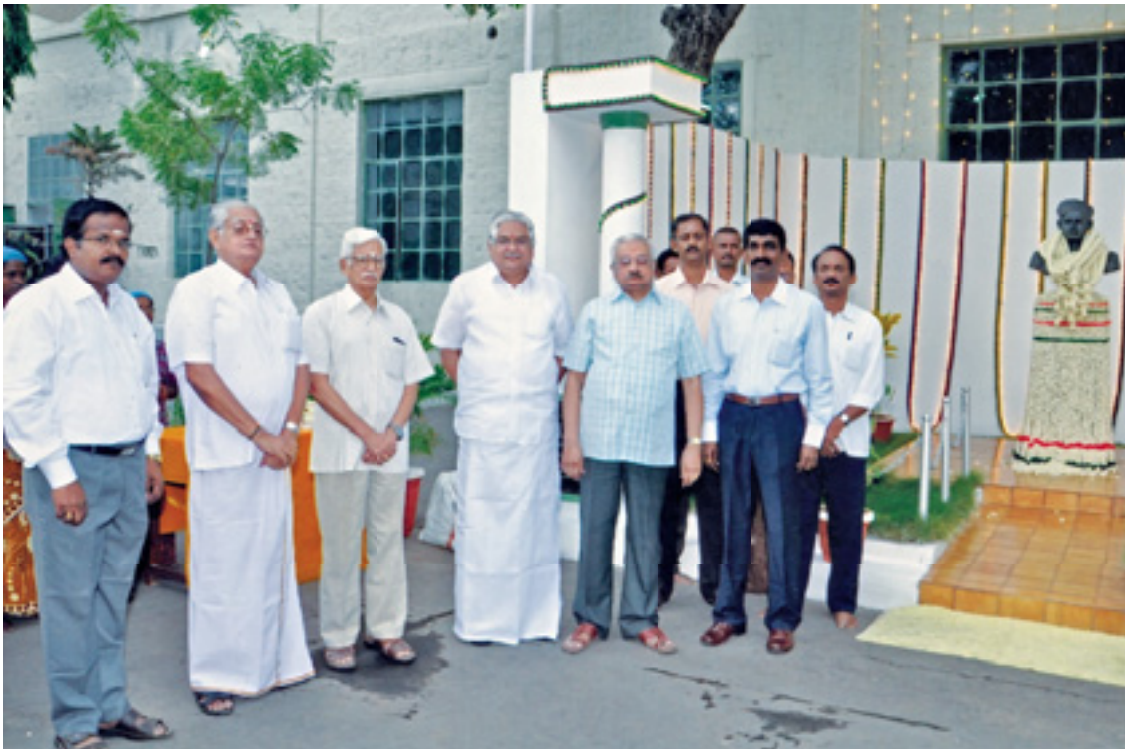
Our Directors and Executives participating on the eve of our Founder's 102 nd Birth day ceremony.