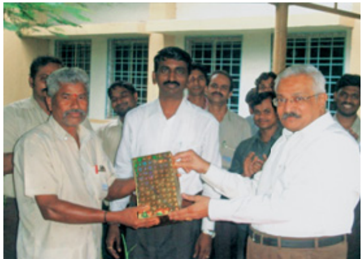
Our President distributing prizes to our Silvassa unit workers for achieving higher productivity.